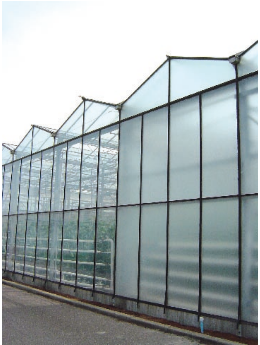
Creating diffused light in a greenhouse with a special covering

Research had been done on the effect of diffused light in forest eco-systems. It was discovered that plants growing under diffused light conditions, are able to use that diffused light more efficiently due to several internal mechanisms within the plant leaves. Wageningen UR Greenhouse Horticulture then started to research how crops in greenhouses would be affected and whether they would see comparable results as in the forest eco-systems and other crops. Studies with crop models displayed promising results. Practical experiments followed and cucumber crops in the Netherlands were put to the test with the first greenhouse trial to be carried out. The crops were cultivated under direct and diffused light, using clear diffuse covering material.