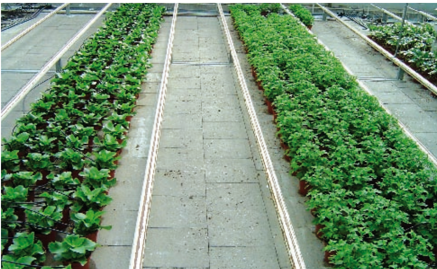
Diffused light can accelerate production of certain crops

During the experiments there was no indication that lower positioned leaves played a significant role in the production process. In fact, the lower leaves turned yellow, proving that less photosynthesis took place. Only the middle leaf layer was more active and showed a higher contribu-